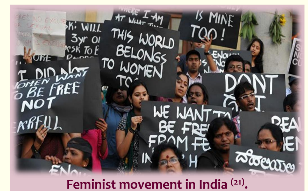
Feminist movement in India (21) .

#3 Link between society and government. Social interventions compensate for governmental shortcomings, or the government acts upon societal pressure by implementing policies to improve women's socio-economic condition. However, the US exert a controlling influence over India, subtly directing it towards Americans' desired structure (20) .